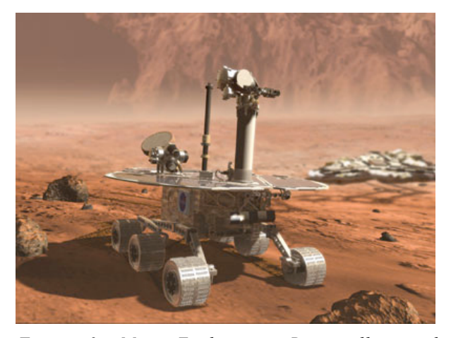
Figure 3: Mars Exploration Rover illustrated departing its lander. MERs can navigate and avoid obstacles an may utilize this capability during their 2004 missions.

In a decade navigation and mobility will diminish as barriers to planetary exploration. Long traverses and access, sometimes with specialized robots, to most locations on a planetary surface will be possible.