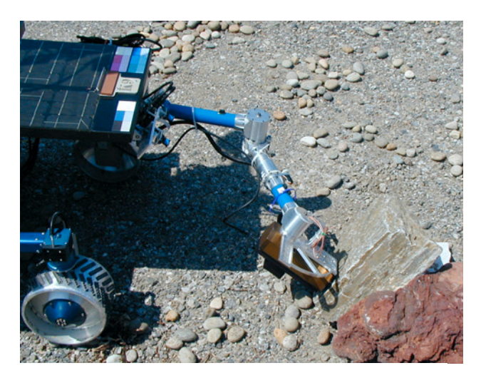
Figure 6: NASA's K9 rover can approach a designated location then automatically determine the best measurement site, deploy its instrument to a rock, and collect science data in a single command cycle.

succeed at traversal, however extreme terrains such as cliff faces still defy any reliable solution. In terms of autonomy, teleoperation with high-bandwidth and lowlatency is mature and supervisory teleoperation with medium bandwidth and latency, such as applied for the MERs, is the state-of-the-art. Nominal development over the decade will deliver autonomous execution of human prescribed plans (over medium bandwidth). With intensive effort rovers will generate and execute plans needing only human assistance. Rovers that are truly independent, that derive their actions from mission objectives and operate with a minimum of human guidance are a decade or more away.