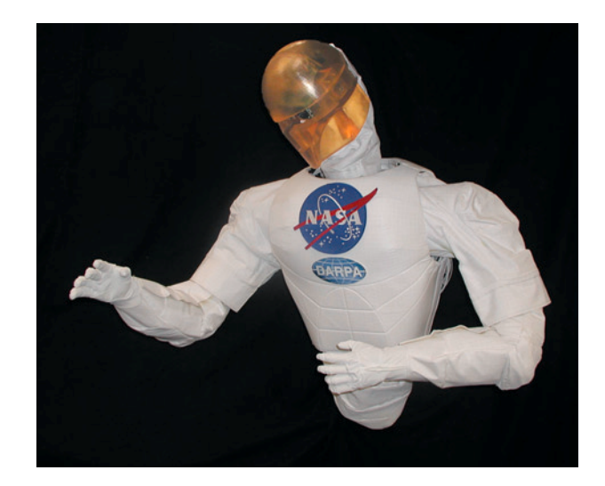
Figure 5: Robonaut at NASA Johnson Space Center is a teleoperated robot with the full range of motion of the human upper body. It is directly teleoperated by a human operator who can see through Robonaut's "eyes" and affect hand and arm position with instrumented gloves.

In the next ten years more dexterous robots, such as the Space Dexterous Robotic Manipulator (SPDM), [7] that can perform routine tasks such as changing out components under teleoperation are likely. With intense effort, these robots may be able to autonomously access and change-out obstructed components. Breakthroughs are needed to achieve