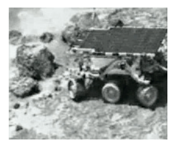
Figure 2: Sojourner on Mars with wheels configured to turn in place to orient for sensor placement, as imaged by the Pathfinder lander. Sojourner received detailed command sequences each communication cycle and exhibited only rudimentary autonomy.

We consider a broad range of space robotics functionalities ( Figure 1) spanning planetary surface exploration and in-space operations. Inputs were received from the researchers and experts at NASA centers and universities, through site visits, interviews, and a web-based questionnaire through which the community consensus on space robotics technologies was assessed.