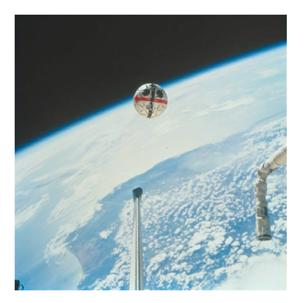
Figure 4: AERCam Sprint during a flight test from the Space Shuttle cargo bay (with tail in view). Free-flying robots could pose a collision risk to the shuttle or station but also reduce risks by offering comprehensive routine inspection.

Our study participant consensus indicated it likely that scientists will be able to interact directly with rovers with high-level goals rather than actions